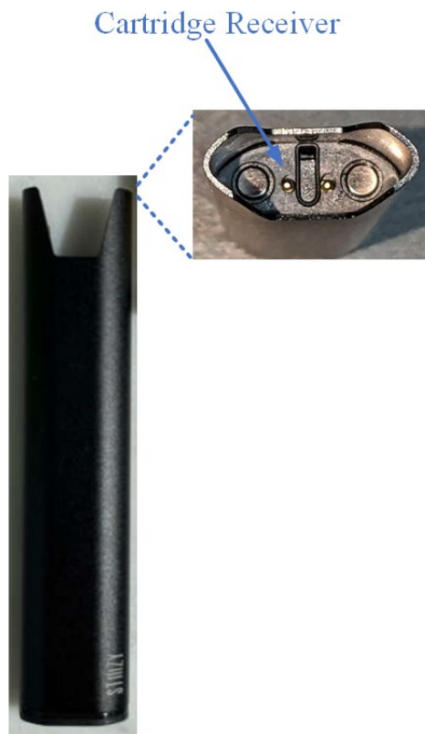
Figure 3: Illustration of cartridge receiver

24. Upon information and belief, Defendants' Accused Products include at least STIIIZY 1 Gram Vaporizer Cartridge, STIIIZY 0.5 Gram Vaporizer Cartridge, STIIIZY (Original) Vaporizer with STIIIZY 0.5 Gram Vaporizer Cartridge, STIIIZY (Original) Vaporizer with STIIIZY 1 Gram Vaporizer Cartridge, STIIIZY BIIG Vaporizer with 0.5 Gram Vaporizer Cartridge, STIIIZY BIIG Vaporizer with 1 Gram Vaporizer Cartridge, STIIIZY LIIL Vaporizer, and components thereof.